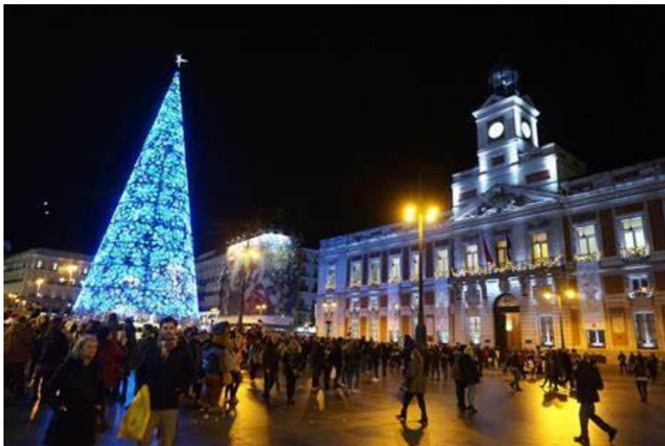
Puerta Del Sol Christmas Tree - Madrid

The Christmas season in Spain kicks off in late November, when festive lights and charming holiday markets spring up in cities and towns throughout the country. From there, it's a non-stop festive extravaganza that doesn't end until the Roscón de Reyes gets polished off.